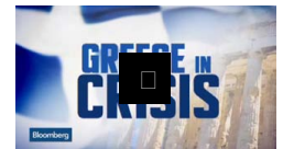
Greece's Varoufakis to Quit if Cuts OK'd