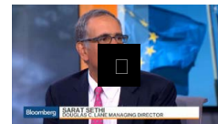
How to Trade Markets During Greece Crisis